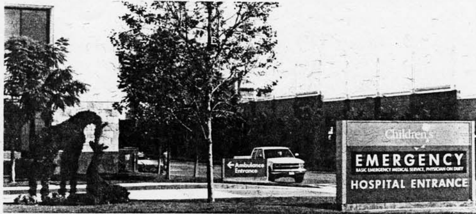
Topiary giraffes guard the entrance to the Emergency Unit.